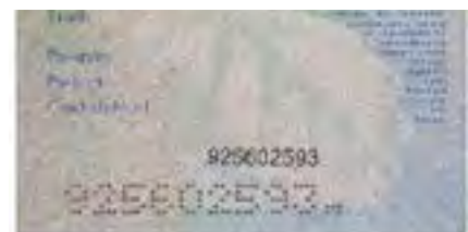
Laser perforations, GBR passport