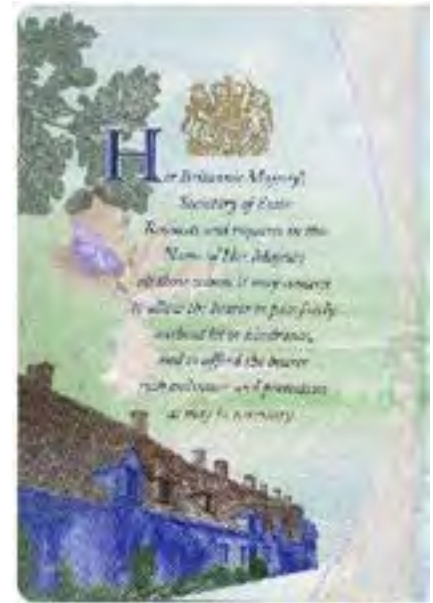
Printed inside front cover, GBR passport

Passports which have been dismantled to remove the pages will often contain empty stitch holes where the original thread used to be. In addition the stitch holes of the page which has been inserted may not match those of the document, again leaving vacant holes.