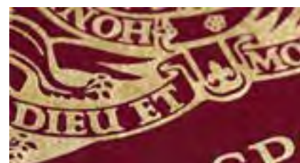
Gold blocking, GBR passport