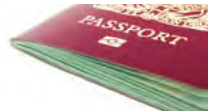
Page alignment, GBR passport