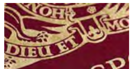
Gold blocking, GBR passport