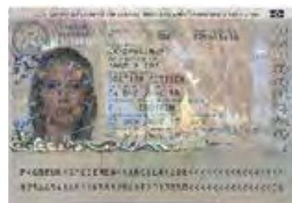
Biodata page, holographic laminate, GBR passport