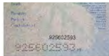
Laser perforations, GBR passport