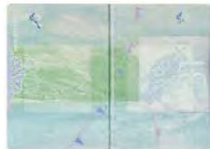
Inner pages, GBR passport

Holograms form part of a group called diffractive optically variable imaging devices or DOVIDS. Anyone with a debit or credit card will be familiar with them. They reveal an image or pattern when light is diffracted by the device. Their use in passports is a strong deterrent to all but the most sophisticated fraudster. The absence of a DOVID in a passport is cause for suspicion.