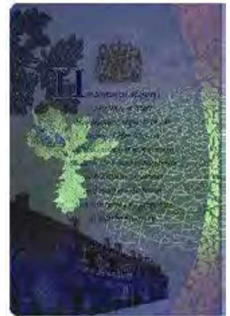
Inside front cover, GBR passport

As noted above, genuine watermarks should never react under UV light. Bear in mind also that some UV features may be less apparent in older but nonetheless genuine documents.