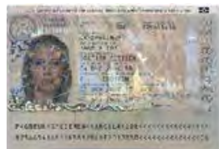
Biodata page, holographic laminate, GBR passport